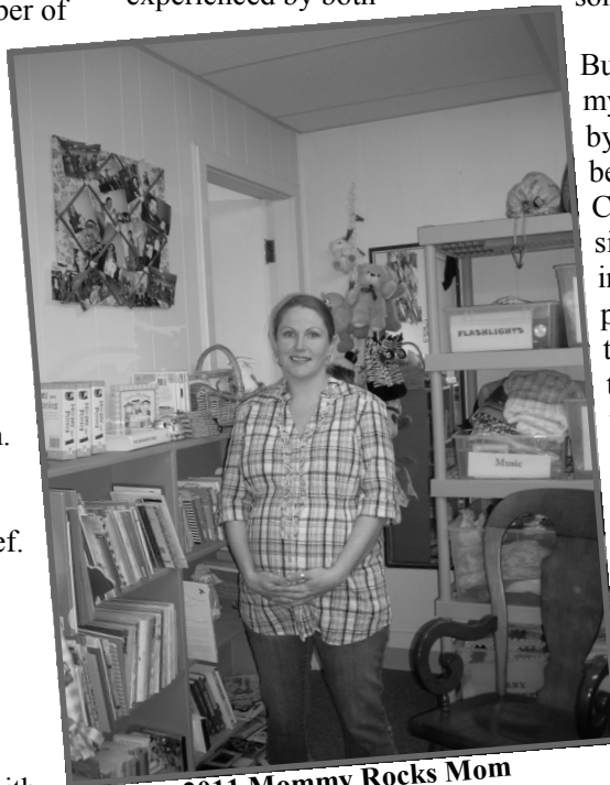
2011 Mommy Rocks Mom

wondering about moms with less than I have. I donate to new moms at church every year. It's easy - buy diapers or a few onesies and drop them off for someone else to deal with.